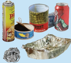
Metal & Aluminum