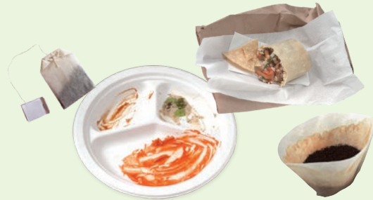
Food & Beverage Soiled Paper