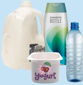
Plastic Containers #1-7