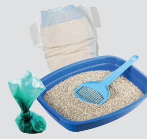
Pet Waste & Diapers