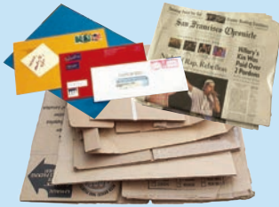
Clean Paper Products