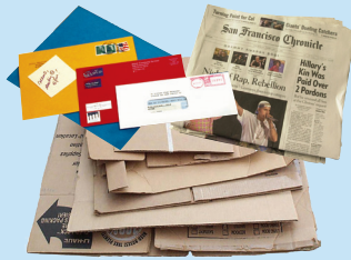
Clean Paper Products

Keep these items out of the Recycle cart