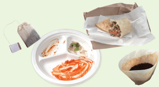
Food & Beverage Soiled Paper

Keep these items out of the Compost cart