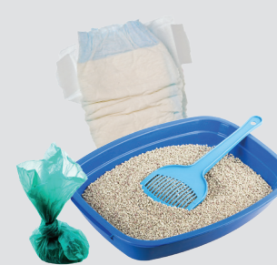
Pet Waste & Diapers

Keep these items out of the Landfill cart