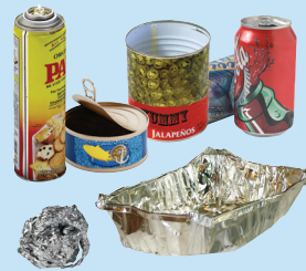
Metal & Aluminum