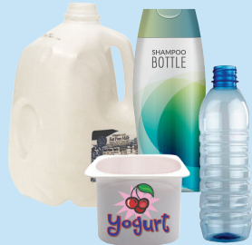
Plastic Containers #1-7